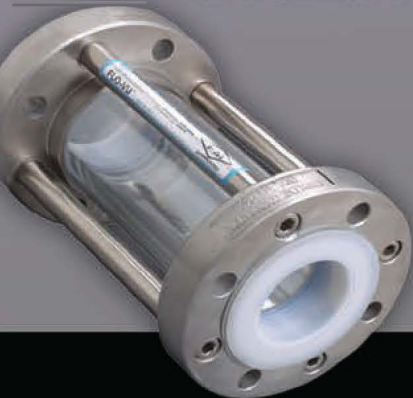
FLO-VU® Durcor® Composite Flanges